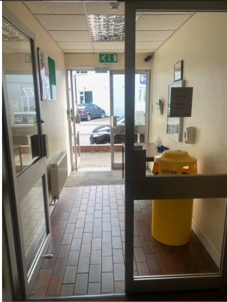
View of main front door, from the lobby