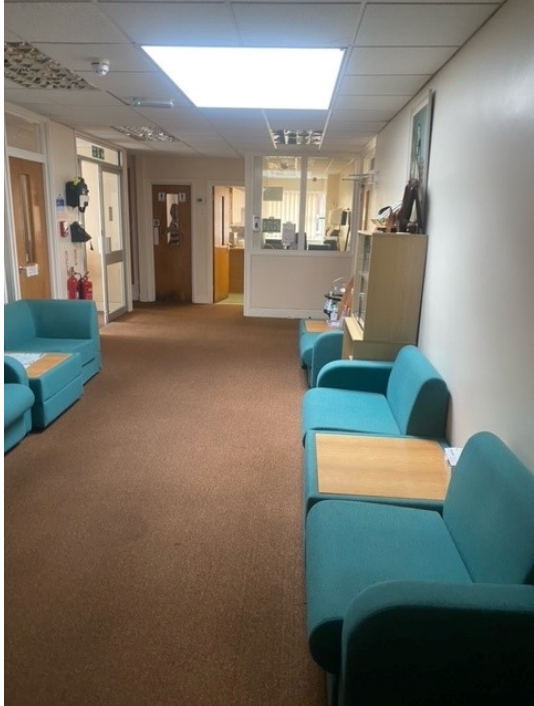
Lobby which leads to the hall, toilets, kitchen and the front door